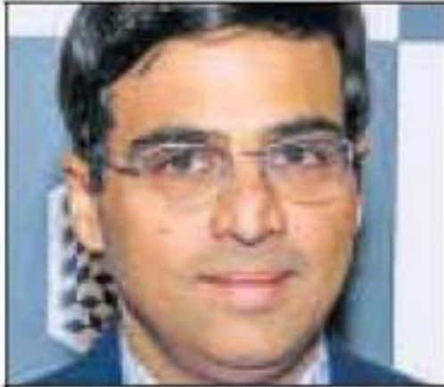
■ Viswanathan Anand